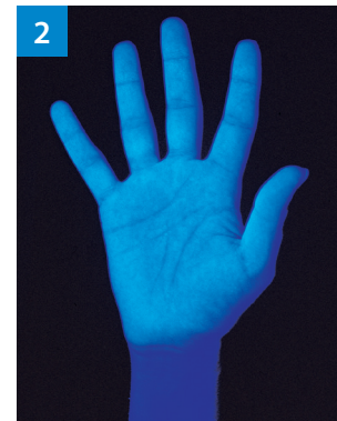
Pic. 2: The surface is consistently light – correct method!

Please also take note of our flyers and stickers on the steps of hygienic hand disinfection.