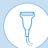
Non-invasive ultrasound probes