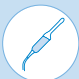
Transvaginal ultrasound probes (TVUS)

gigasept® powerSET3 – for reprocessing of the following non-lumened medical devices*: