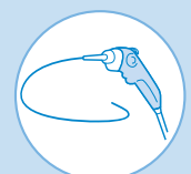
Flexible endoscopes without channels (e.g. nasopharyngoscopes)