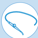
Transesophageal ultrasound probes (TEE/TOE)